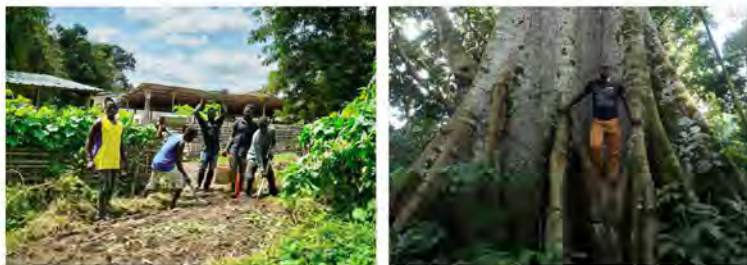
Since the start of the project in Togo in 2010, more than 1.5 million native trees have been planted.

For film packaging manufacturer Poly-Pack, protecting the environment is not only an extremely important concern. Poly-Pack also does everything humanly possible for it. Among other things, it was again able to achieve 100% climate neutrality in 2021. The ratio of recycled material in film processing also remained constant at well over 90%.