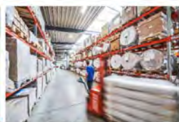
Großes Rohstofflager – schnelle Lieferzeit