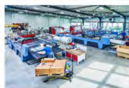
Produktion am Standort Iserlohn

2 Pressemitteilung Poly-Pack | Mai 2022_ Umweltschutz